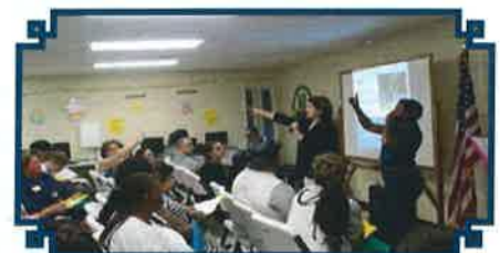
Residents should ask about any impacts converting to Section 8 may have on their rent, repairs that might be done on the property, and whether residents will need to be relocated temporarily.

PHA Plan. Note that in addition to meeting with residents of the converting project, a PHA must also amend its PHA Plan to reflect the proposed RAD conversion and solicit community input. As part of this process, a PHA will hold separate public meetings and collect comments.