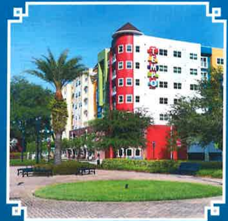
The Tempo at Encore, Tampa Housing Authority

Public Housing Agencies (PHAs) use the Rental Assistance Demonstration (RAD) Program to preserve affordable housing and improve properties by "converting" their form of federal assistance to the Section 8 program. PHAs choose to convert to either: Section 8 project-based voucher (PBV) or Section 8 project-based rental assistance (PBRA).